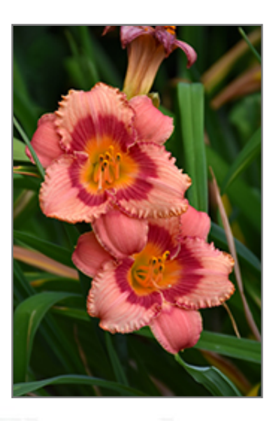
Strawberry Candy Daylily flowers

A long blooming selection that features bright coral pink flowers with cherry red ruffled edges and eyezones; reblooming habit, a great way to add color to borders and beds throughout the summer months