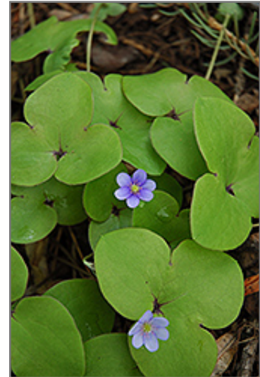
European Liverleaf flowers

A slow growing, semi-evergreen variety producing weather resistant violet-blue flowers in the early spring; an undemanding addition to beds, borders, rocks gardens and containers; provides a pop of color when needed most; low maintenance