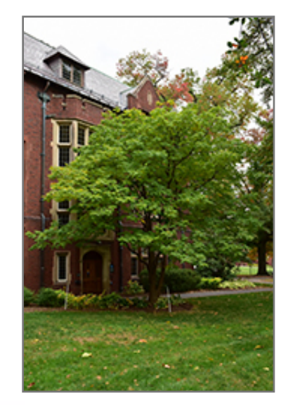
Amur Maackia

This is a relatively low maintenance tree, and is best pruned in late winter once the threat of extreme cold has passed. It has no significant negative characteristics.