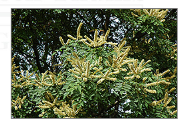
Amur Maackia flowers

Amur Maackia is recommended for the following landscape applications;