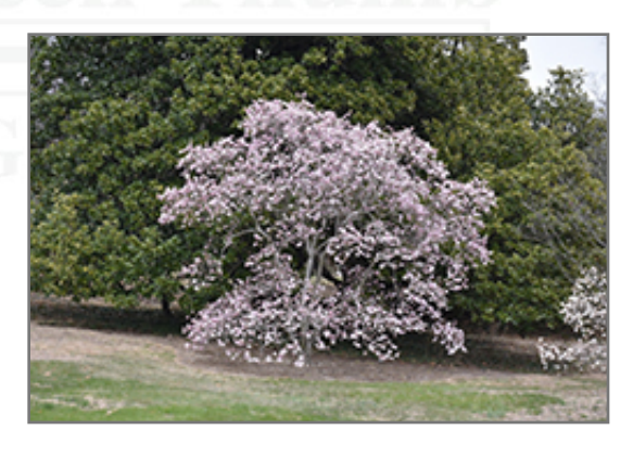
Leonard Messel Magnolia in bloom