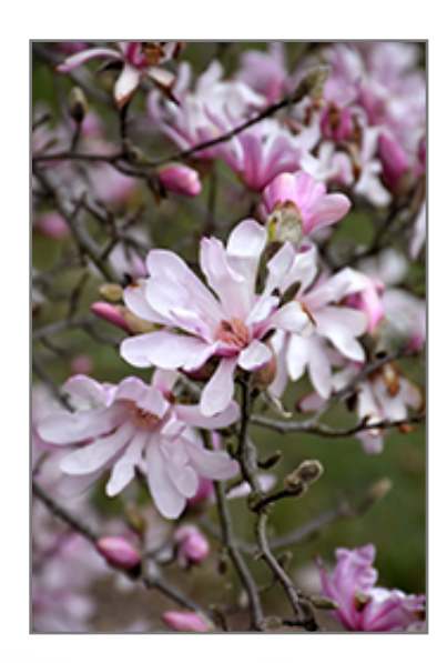
Leonard Messel Magnolia flowers

This is a relatively low maintenance tree, and should only be pruned after flowering to avoid removing any of the current season's flowers. Deer don't particularly care for this plant and will usually leave it alone in favor of tastier treats. It has no significant negative characteristics.