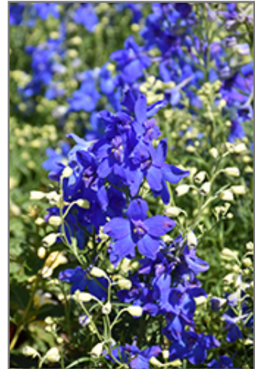
Summer Nights Delphinium flowers

Summer Nights Delphinium is an herbaceous perennial with a mounded form. It brings an extremely fine and delicate texture to the garden composition and should be used to full effect.