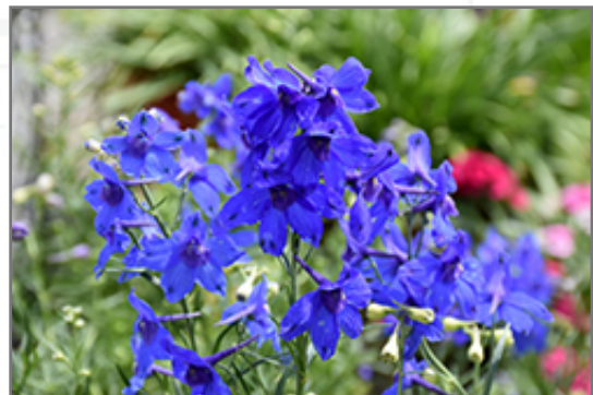
Summer Nights Delphinium flowers