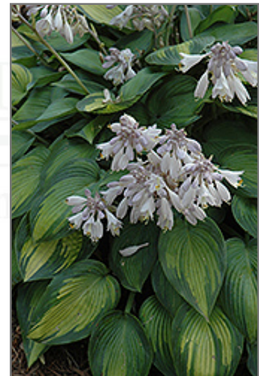
June Hosta flowers