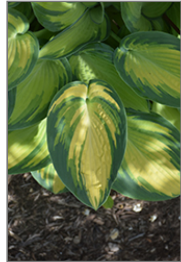
June Hosta foliage

This plant does best in partial shade to shade. It prefers to grow in average to moist conditions, and shouldn't be allowed to dry out. It is not particular as to soil type or pH. It is somewhat tolerant of urban pollution. This particular variety is an interspecific hybrid. It can be propagated by division; however, as a cultivated variety, be aware that it may be subject to certain restrictions or prohibitions on propagation.