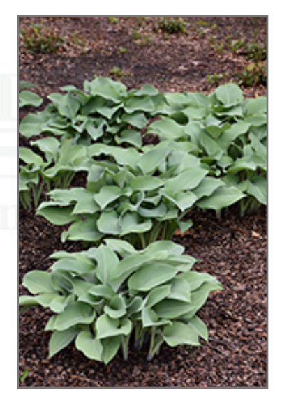
Krossa Regal Hosta