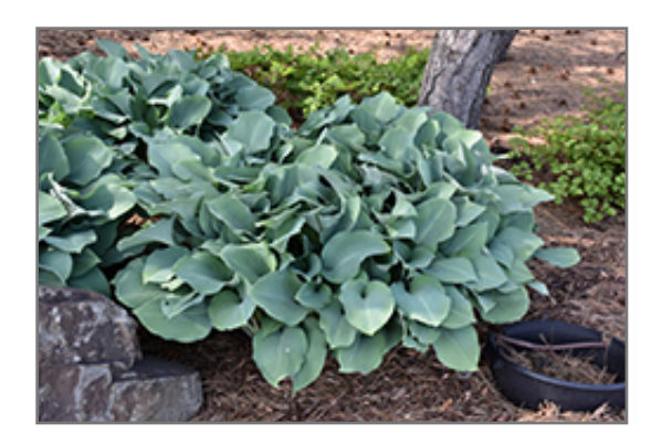
Krossa Regal Hosta

Krossa Regal Hosta is a dense herbaceous perennial with tall flower stalks held atop a low mound of foliage. Its wonderfully bold, coarse texture can be very effective in a balanced garden composition.