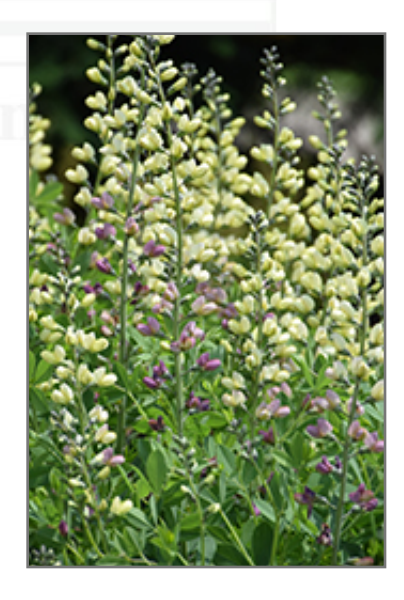
Decadence Deluxe Pink Lemonade False Indigo flowers