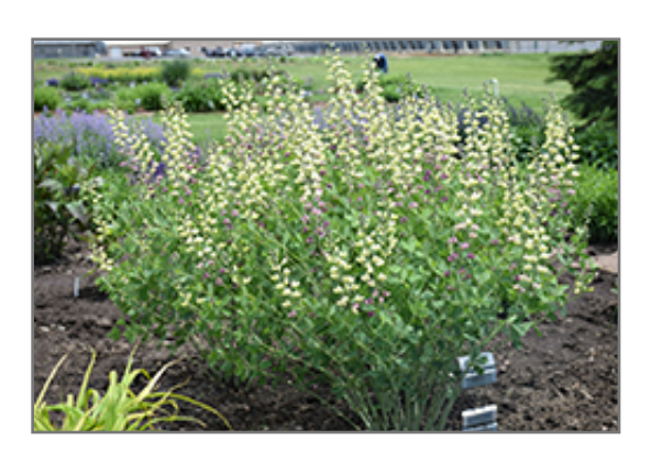
Decadence Deluxe Pink Lemonade False Indigo in bloom

Decadence Deluxe Pink Lemonade False Indigo is a fine choice for the garden, but it is also a good selection for planting in outdoor pots and containers. With its upright habit of growth, it is best suited for use as a 'thriller' in the 'spiller-thriller-filler' container combination; plant it near the center of the pot, surrounded by smaller plants and those that spill over the edges. It is even sizeable enough that it can be grown alone in a suitable container. Note that when growing plants in outdoor containers and baskets, they may require more frequent waterings than they would in the yard or garden. Be aware that in our climate, most plants cannot be expected to survive the winter if left in containers outdoors, and this plant is no exception. Contact our experts for more information on how to protect it over the winter months.