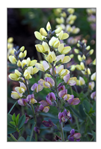
Decadence Deluxe Pink Lemonade False Indigo flowers

Decadence Deluxe Pink Lemonade False Indigo is an herbaceous perennial with an upright spreading habit of growth. Its medium texture blends into the garden, but can always be balanced by a couple of finer or coarser plants for an effective composition.