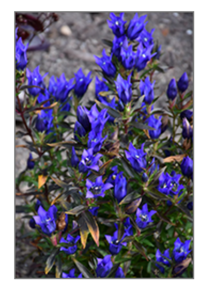
True Blue Gentian flowers

True Blue Gentian is recommended for the following landscape applications;