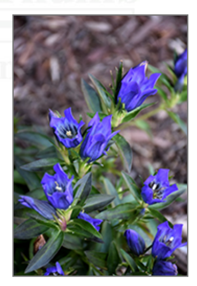
True Blue Gentian flowers