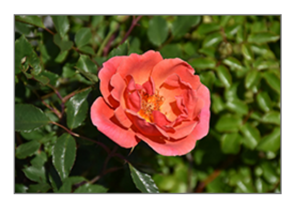
Coral Knock Out Rose flowers

One of the most popular roses in the world today, primarily due to its low maintenance, superior disease resistance and incredibly long period of bloom, with seemingly endless brick orange to coral flowers; all roses need full sun and well-drained soil