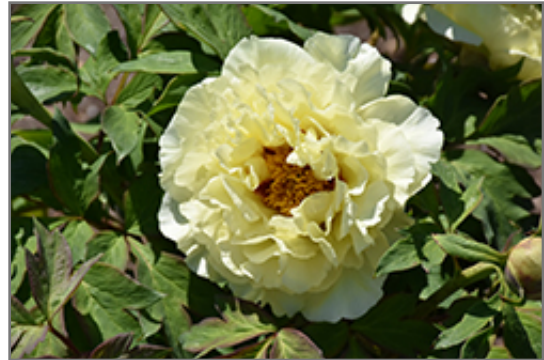
High Noon Tree Peony flowers