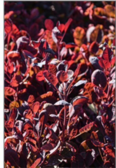
Velveteeny Purple Smokebush foliage

Velveteeny Purple Smokebush makes a fine choice for the outdoor landscape, but it is also well-suited for use in outdoor pots and containers. With its upright habit of growth, it is best suited for use as a 'thriller' in the 'spiller-thriller-filler' container combination; plant it near the center of the pot, surrounded by smaller plants and those that spill over the edges. It is even sizeable enough that it can be grown alone in a suitable container. Note that when grown in a container, it may not perform exactly as indicated on the tag - this is to be expected. Also note that when growing plants in outdoor containers and baskets, they may require more frequent waterings than they would in the yard or garden. Be aware that in our climate, most plants cannot be expected to survive the winter if left in containers outdoors, and this plant is no exception. Contact our experts for more information on how to protect it over the winter months.