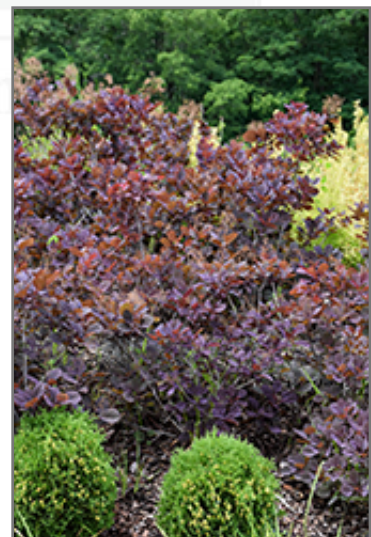
Velveteeny Purple Smokebush