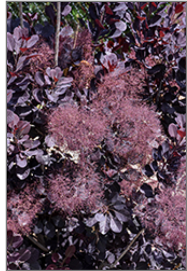
Velveteeny Purple Smokebush flowers

Velveteeny Purple Smokebush is recommended for the following landscape applications;