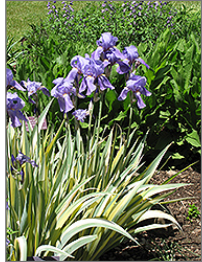
Golden Variegated Sweet Iris in bloom

Golden Variegated Sweet Iris is recommended for the following landscape applications;