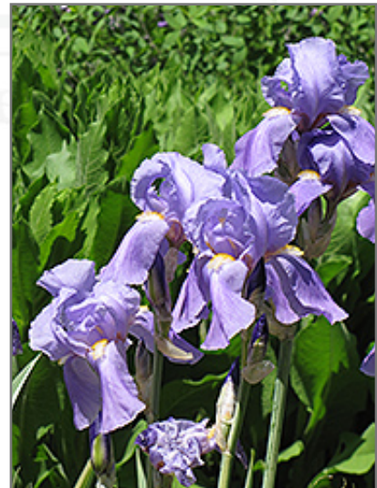
Golden Variegated Sweet Iris flowers