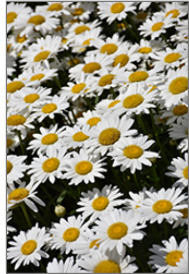
Becky Shasta Daisy flowers