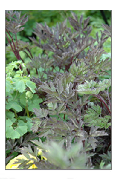
Hillside Black Beauty Bugbane

A native perennial presenting numerous spikes of fragrant, white flowers that are blushed with pink, in mid to late summer; contrasting dark purplish-black foliage; shelter from strong winds; perfect for a shady, woodland garden