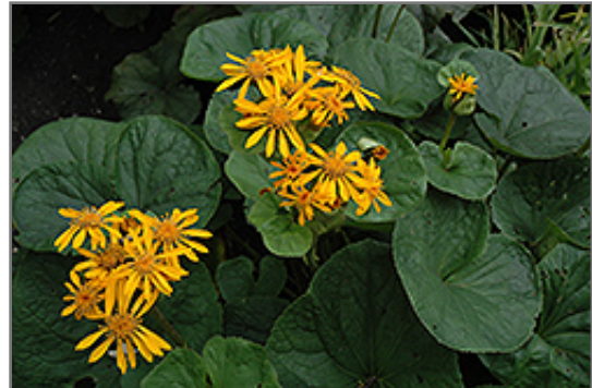
Desdemona Rayflower flowers