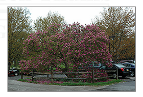
Susan Magnolia in bloom

Susan Magnolia is recommended for the following landscape applications;