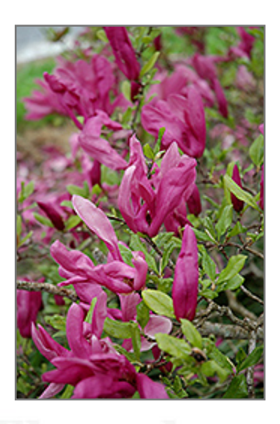
Susan Magnolia flowers

This is a relatively low maintenance shrub, and should only be pruned after flowering to avoid removing any of the current season's flowers. It has no significant negative characteristics.