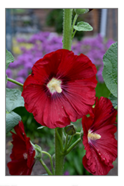
Mars Magic Hollyhock flowers

Featuring stunning deep red flowers with cream centers, on towering spikes in midsummer; tolerant to the natural toxin formed by the roots of Black Walnut; selections from this series are truly perennial; plant in full sun for better growth