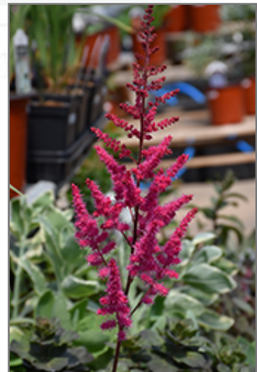
Mighty Chocolate Cherry Chinese Astilbe flowers