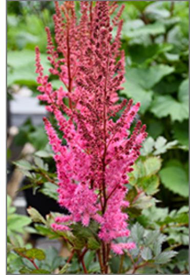
Mighty Chocolate Cherry Chinese Astilbe flowers

Mighty Chocolate Cherry Chinese Astilbe is an herbaceous perennial with an upright spreading habit of growth. Its relatively fine texture sets it apart from other garden plants with less refined foliage.