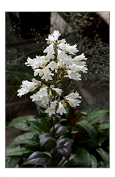
Onyx and Pearls Beard Tongue flowers

An impressive penstemon producing soft lavender flowers with white interiors, vividly contrasting deep eggplant purple foliage on equally dark stems; makes a beautiful visual impact when massed in the garden, along walkways, or in borders