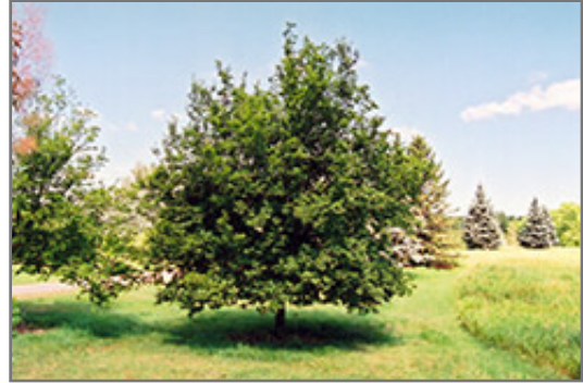
Hop Hornbeam