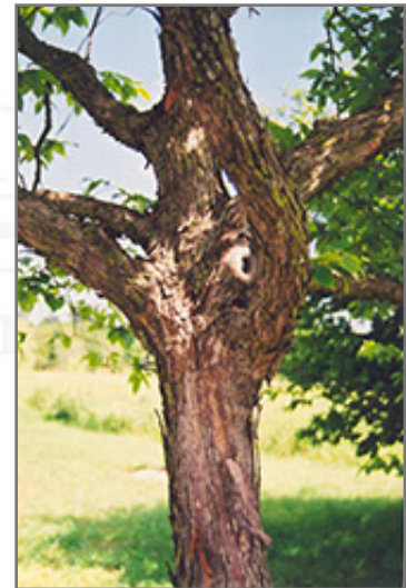
Hop Hornbeam bark