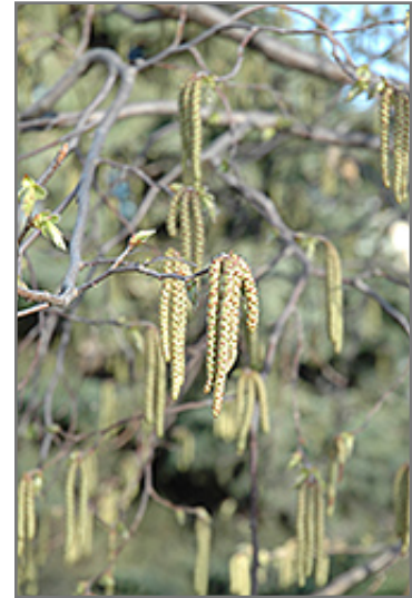
Hop Hornbeam flowers

This tree does best in full sun to partial shade. It is very adaptable to both dry and moist locations, and should do just fine under average home landscape conditions. It is not particular as to soil type or pH. It is quite intolerant of urban pollution, therefore inner city or urban streetside plantings are best avoided, and will benefit from being planted in a relatively sheltered location. Consider applying a thick mulch around the root zone in winter to protect it in exposed locations or colder microclimates. This species is native to parts of North America.