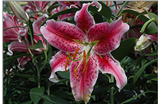
Stargazer Lily flowers