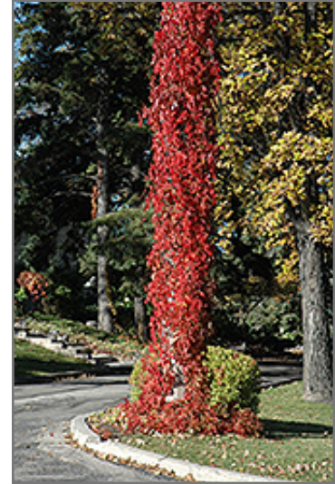
Virginia Creeper in fall

Virginia Creeper is recommended for the following landscape applications;