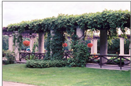
Virginia Creeper