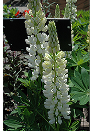
Russell White Lupine flowers