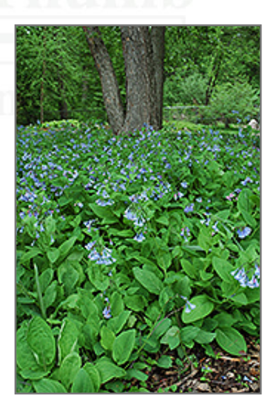
Virginia Bluebells in bloom