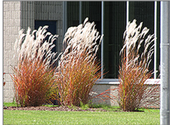
Flame Grass in bloom

Flame Grass is recommended for the following landscape applications;