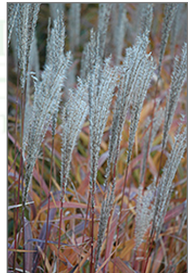
Flame Grass fruit