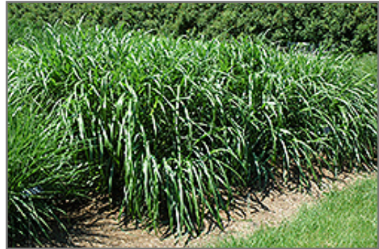
Flame Grass

Flame Grass will grow to be about 4 feet tall at maturity, with a spread of 4 feet. It tends to be leggy, with a typical clearance of 1 foot from the ground, and should be underplanted with lower-growing perennials. It grows at a medium rate, and under ideal conditions can be expected to live for approximately 20 years.