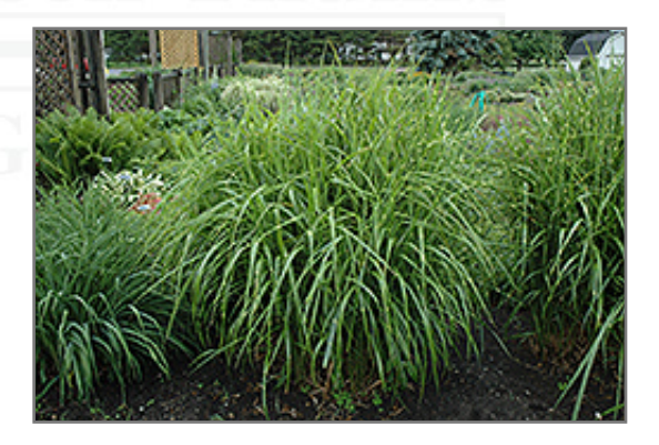
Porcupine Grass