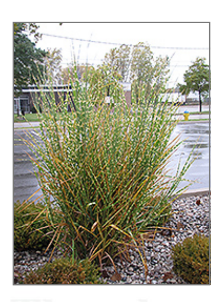
Porcupine Grass

Porcupine Grass is recommended for the following landscape applications;