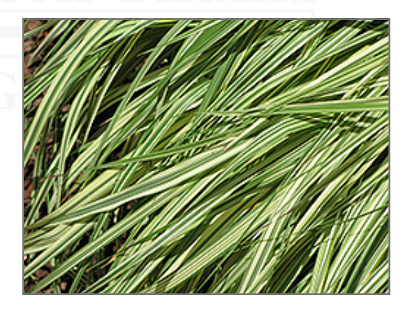
Variegated Moor Grass foliage