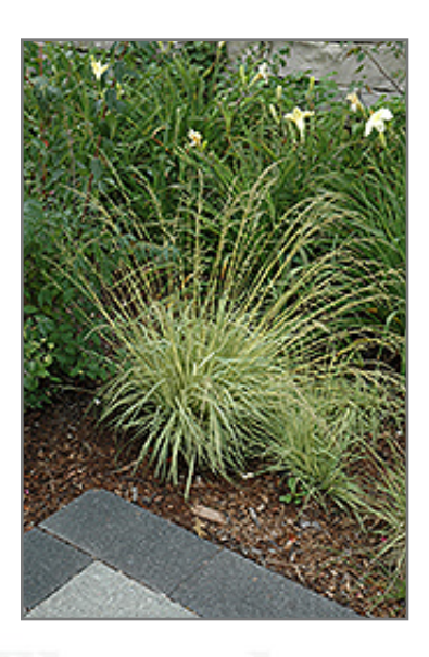
Variegated Moor Grass