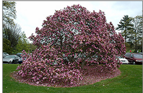
Betty Magnolia in bloom

Betty Magnolia is recommended for the following landscape applications;