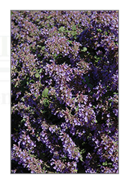
Walker's Low Catmint flowers

Walker's Low Catmint is recommended for the following landscape applications;