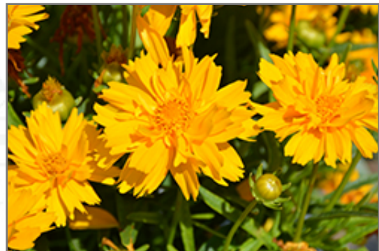
Double the Sun Tickseed flowers