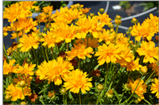
Double the Sun Tickseed in bloom

Double the Sun Tickseed is recommended for the following landscape applications;