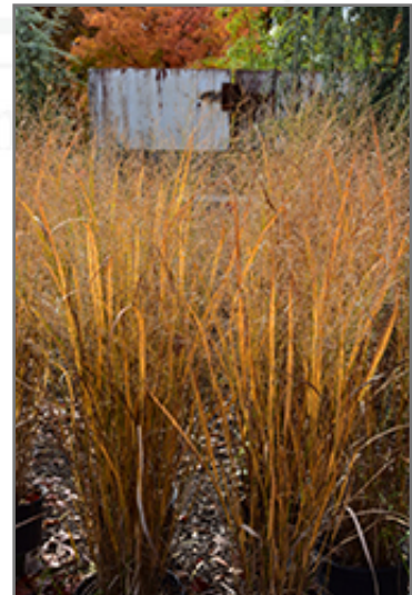
Northwind Switch Grass in fall