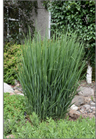
Northwind Switch Grass