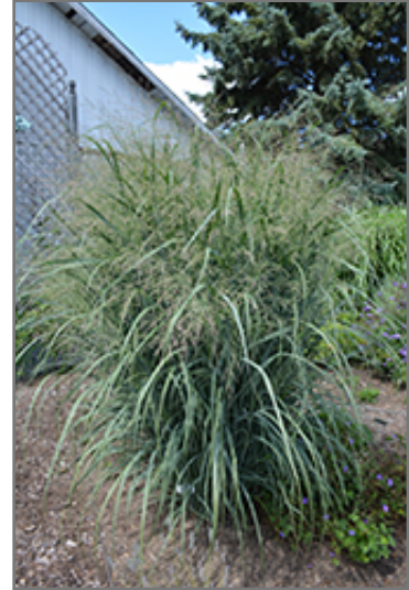
Northwind Switch Grass in bloom

This plant does best in full sun to partial shade. It is very adaptable to both dry and moist locations, and should do just fine under typical garden conditions. It is considered to be drought-tolerant, and thus makes an ideal choice for a low-water garden or xeriscape application. It is not particular as to soil type, but has a definite preference for alkaline soils, and is able to handle environmental salt. It is somewhat tolerant of urban pollution. This is a selection of a native North American species. It can be propagated by division; however, as a cultivated variety, be aware that it may be subject to certain restrictions or prohibitions on propagation.