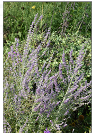
Russian Sage flowers