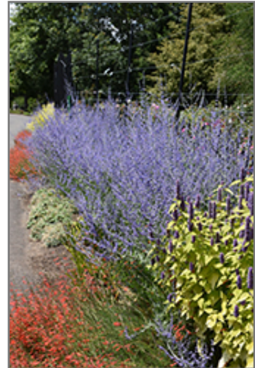
Russian Sage in bloom