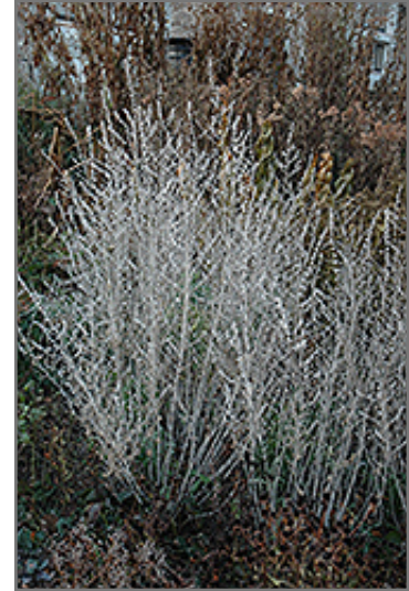
Russian Sage in winter

This plant should only be grown in full sunlight. It prefers dry to average moisture levels with very well-drained soil, and will often die in standing water. It is considered to be drought-tolerant, and thus makes an ideal choice for a low-water garden or xeriscape application. It is not particular as to soil type, but has a definite preference for alkaline soils. It is highly tolerant of urban pollution and will even thrive in inner city environments. This species is not originally from North America.