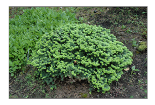
Dwarf Balsam Fir