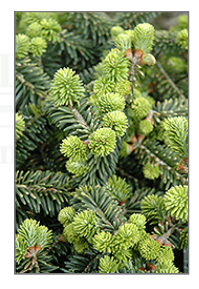
Dwarf Balsam Fir foliage