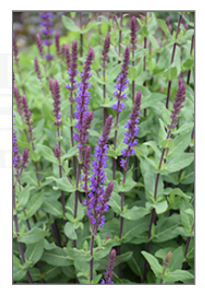
Caradonna Sage flowers