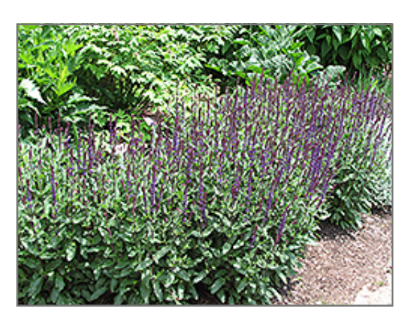
Caradonna Sage in bloom

Caradonna Sage will grow to be about 24 inches tall at maturity, with a spread of 24 inches. When grown in masses or used as a bedding plant, individual plants should be spaced approximately 18 inches apart. It grows at a medium rate, and under ideal conditions can be expected to live for approximately 5 years. As an herbaceous perennial, this plant will usually die back to the crown each winter, and will regrow from the base each spring. Be careful not to disturb the crown in late winter when it may not be readily seen!