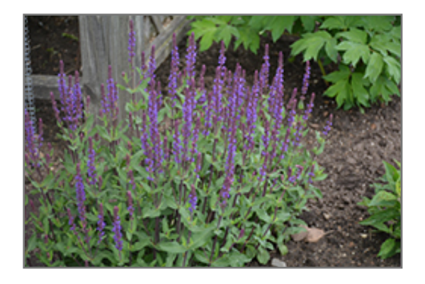
Caradonna Sage in bloom

Caradonna Sage is an herbaceous perennial with an upright spreading habit of growth. Its relatively fine texture sets it apart from other garden plants with less refined foliage.