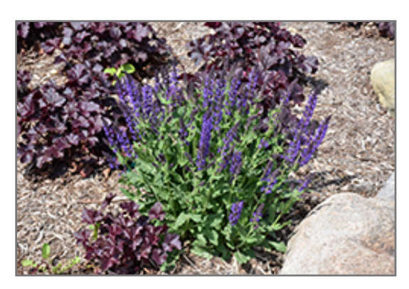
May Night Sage in bloom

May Night Sage will grow to be about 18 inches tall at maturity extending to 24 inches tall with the flowers, with a spread of 18 inches. When grown in masses or used as a bedding plant, individual plants should be spaced approximately 15 inches apart. It grows at a medium rate, and under ideal conditions can be expected to live for approximately 5 years. As an herbaceous perennial, this plant will usually die back to the crown each winter, and will regrow from the base each spring. Be careful not to disturb the crown in late winter when it may not be readily seen!