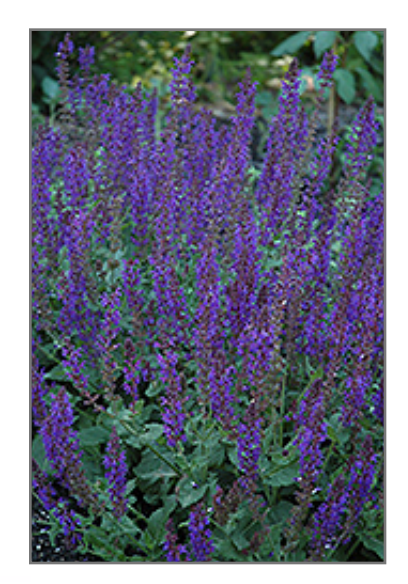
May Night Sage flowers

This is a relatively low maintenance plant, and is best cleaned up in early spring before it resumes active growth for the season. It is a good choice for attracting butterflies and hummingbirds to your yard, but is not particularly attractive to deer who tend to leave it alone in favor of tastier treats. It has no significant negative characteristics.