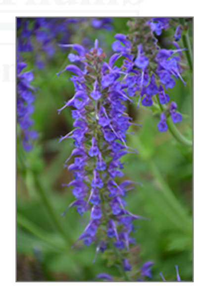
May Night Sage flowers