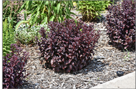
Dark Magic Stonecrop in bloom