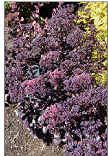
Dark Magic Stonecrop in bloom