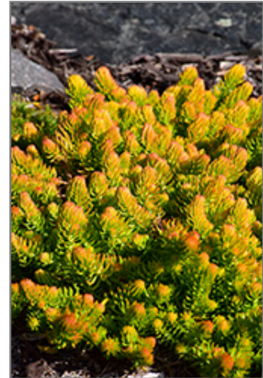
Angelina Stonecrop foliage

Angelina Stonecrop is recommended for the following landscape applications;