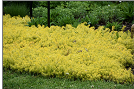
Angelina Stonecrop

Angelina Stonecrop will grow to be about 8 inches tall at maturity, with a spread of 12 inches. When grown in masses or used as a bedding plant, individual plants should be spaced approximately 10 inches apart. Its foliage tends to remain low and dense right to the ground. It grows at a fast rate, and under ideal conditions can be expected to live for approximately 10 years. As an herbaceous perennial, this plant will usually die back to the crown each winter, and will regrow from the base each spring. Be careful not to disturb the crown in late winter when it may not be readily seen!