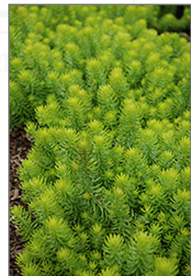
Angelina Stonecrop foliage