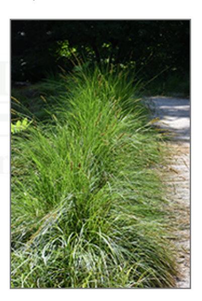
Autumn Moor Grass