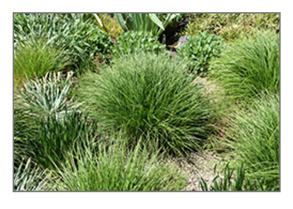
Autumn Moor Grass