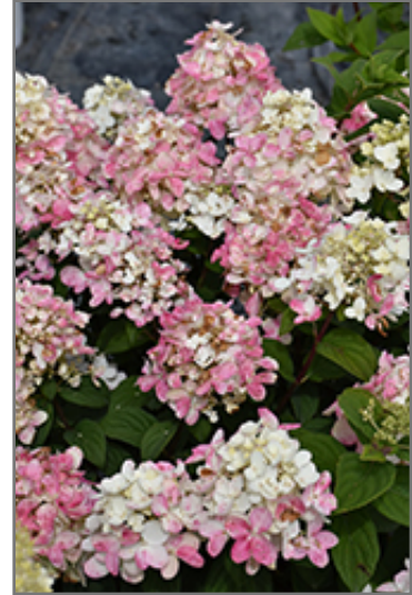
Fire Light Tidbit Hydrangea flowers (faded)

Fire Light Tidbit Hydrangea is recommended for the following landscape applications;