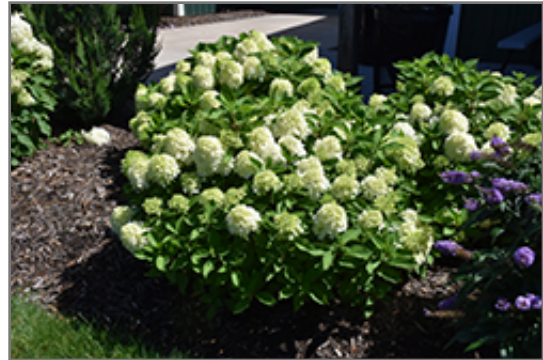
Fire Light Tidbit Hydrangea in bloom

Fire Light Tidbit Hydrangea makes a fine choice for the outdoor landscape, but it is also well-suited for use in outdoor pots and containers. Because of its height, it is often used as a 'thriller' in the 'spiller-thriller-filler' container combination; plant it near the center of the pot, surrounded by smaller plants and those that spill over the edges. It is even sizeable enough that it can be grown alone in a suitable container. Note that when grown in a container, it may not perform exactly as indicated on the tag - this is to be expected. Also note that when growing plants in outdoor containers and baskets, they may require more frequent waterings than they would in the yard or garden. Be aware that in our climate, most plants cannot be expected to survive the winter if left in containers outdoors, and this plant is no exception. Contact our experts for more information on how to protect it over the winter months.