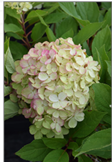
Fire Light Tidbit Hydrangea flowers