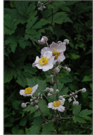
Grapeleaf Anemone flowers