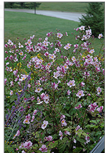
Grapeleaf Anemone flowers