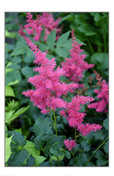
Younique Ruby Red Astilbe flowers

Feathery ruby red plumes, rise above dense foliage; best in a shady spot with dappled light; prefers moisture so water regularly for abundant flowers and nice foliage; perfect for mixed containers; plume heads can be left for winter interest