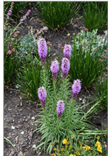
Blazing Star in bloom