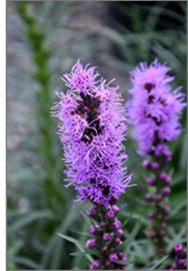
Blazing Star flowers