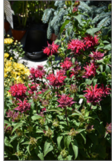
BeeMine Red Beebalm flowers

BeeMine Red Beebalm is an herbaceous perennial with a mounded form. Its medium texture blends into the garden, but can always be balanced by a couple of finer or coarser plants for an effective composition.