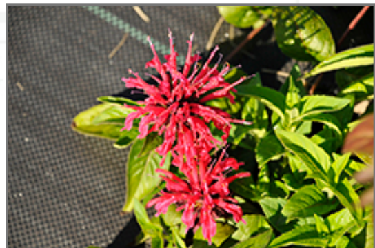
BeeMine Red Beebalm flowers