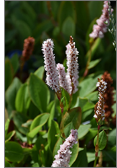
Dimity Dwarf Fleeceflower flowers

This variety forms a spreading mat of deep green, leathery leaves that turn bronze-red in fall; short spikes of deep red flowers appear in summer, fading to soft pink; an excellent groundcover that tolerates light foot traffic