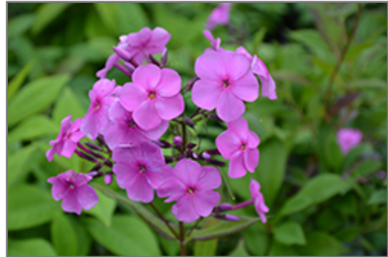
Super Ka-Pow Pink Garden Phlox flowers

Super Ka-Pow Pink Garden Phlox is recommended for the following landscape applications;