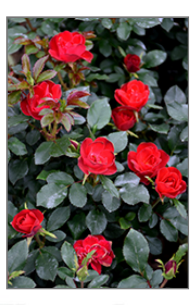
Petite Knock Out Rose flowers

A stunning miniature selection of the Knock Out family, with the same low maintenance, superior disease resistance and incredibly long period of bloom; bright red flowers are seemingly endless; all roses need full sun and well-drained soil