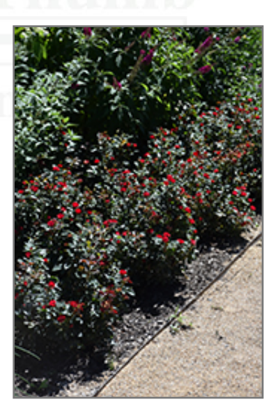
Petite Knock Out Rose in bloom