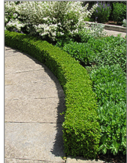
Green Velvet Boxwood

Green Velvet Boxwood makes a fine choice for the outdoor landscape, but it is also well-suited for use in outdoor pots and containers. Because of its height, it is often used as a 'thriller' in the 'spiller-thriller-filler' container combination; plant it near the center of the pot, surrounded by smaller plants and those that spill over the edges. It is even sizeable enough that it can be grown alone in a suitable container. Note that when grown in a container, it may not perform exactly as indicated on the tag - this is to be expected. Also note that when growing plants in outdoor containers and baskets, they may require more frequent waterings than they would in the yard or garden. Be aware that in our climate, most plants cannot be expected to survive the winter if left in containers outdoors, and this plant is no exception. Contact our experts for more information on how to protect it over the winter months.