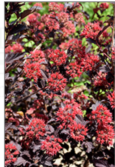
Center Glow Ninebark fruit