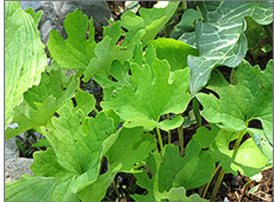
Bloodroot foliage

Bloodroot is recommended for the following landscape applications;